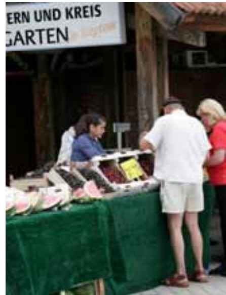
Parking - The Treptower Park