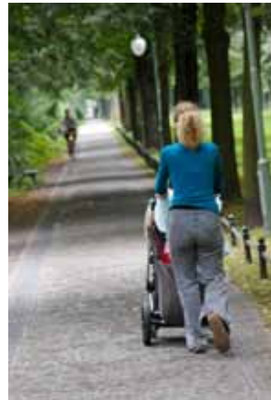
Parking - The Tiergarten