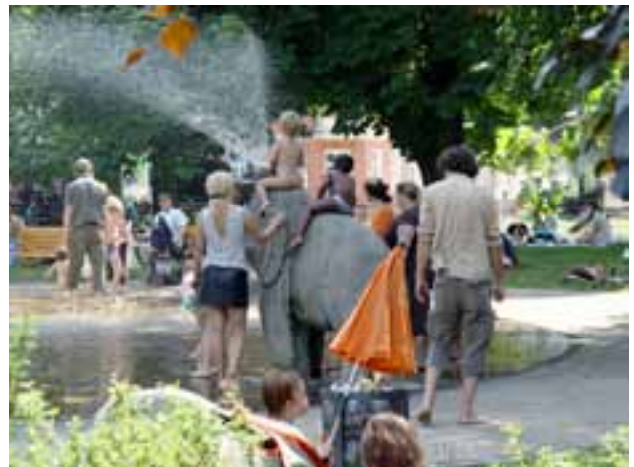
Parking - The Public Park Friedrichshain