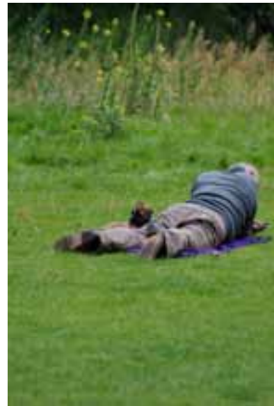
Parking - The Tiergarten