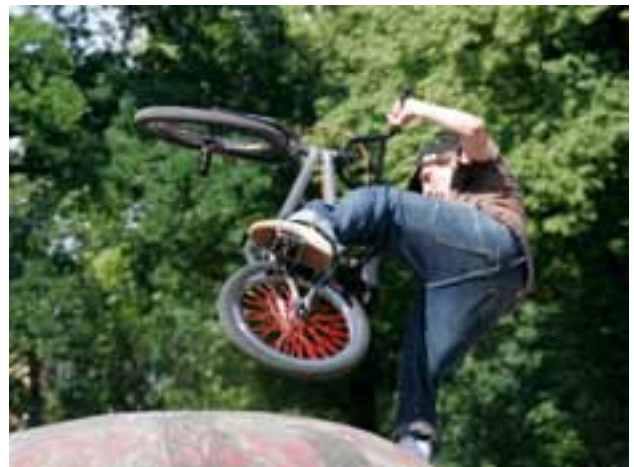
Parking - The Public Park Friedrichshain