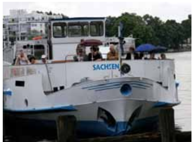
Parking - The Treptower Park