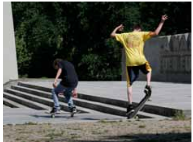
Parking - The Public Park Friedrichshain