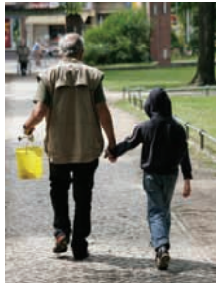
Parking - Small parks in Berlin, Spandau