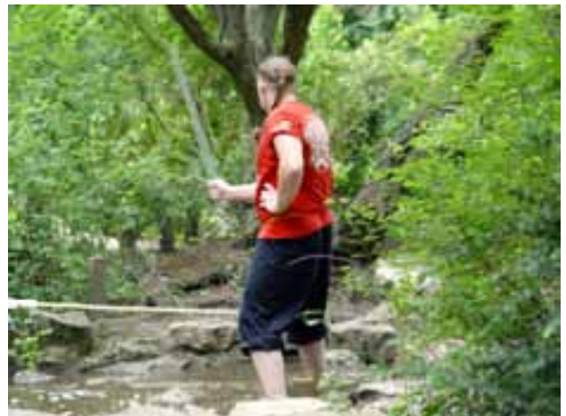
Parking - The viktoriapark