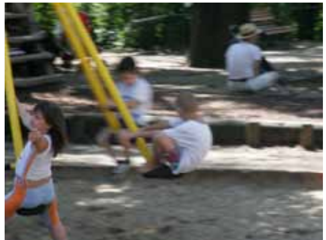
Parking - The viktoriapark