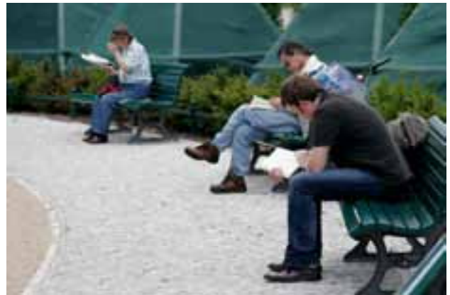
Parking - The Tiergarten