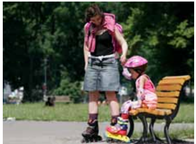
Parking - The Public Park Friedrichshain