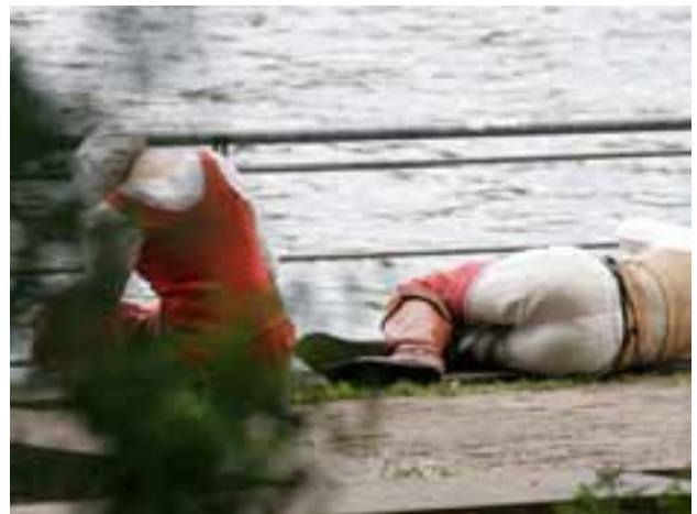
Parking - The Treptower Park