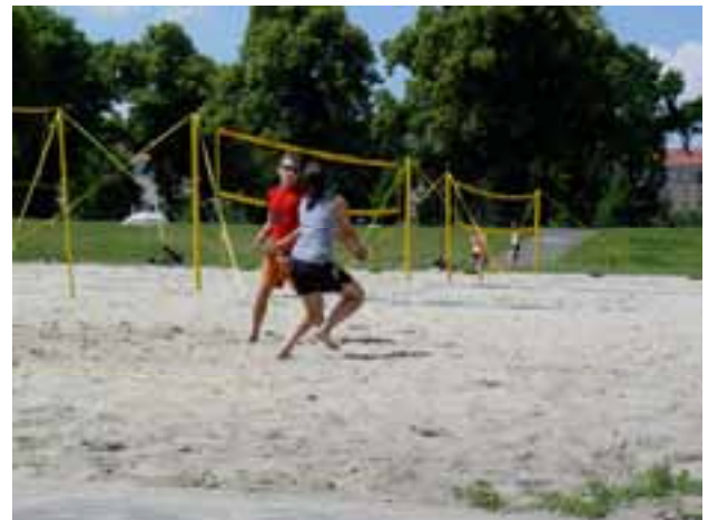
Parking - The Public Park Friedrichshain