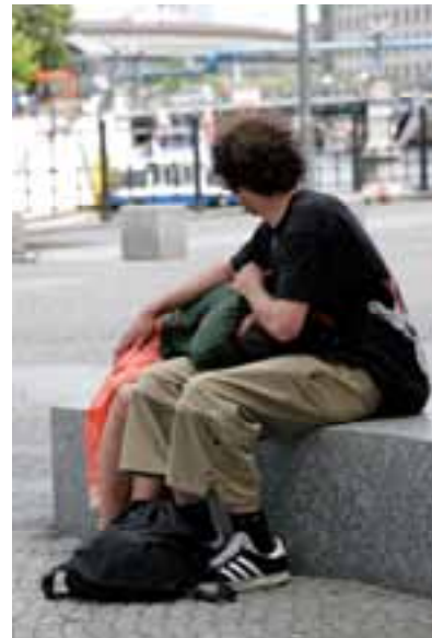
Parking - The area around the Government Quarter