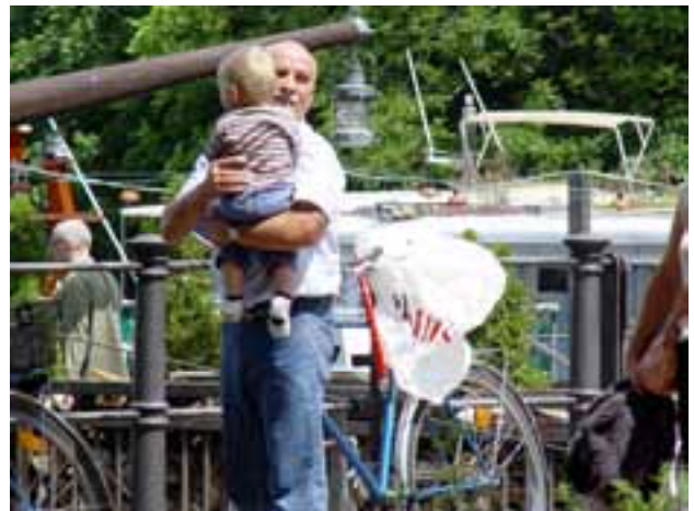
Parking - The Treptower Park