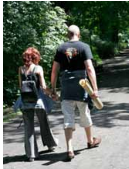
Parking - The Treptower Park