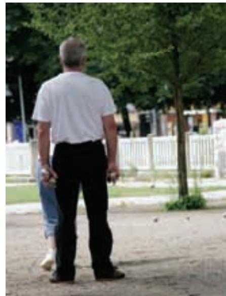
Parking - Small parks in Berlin, Spandau