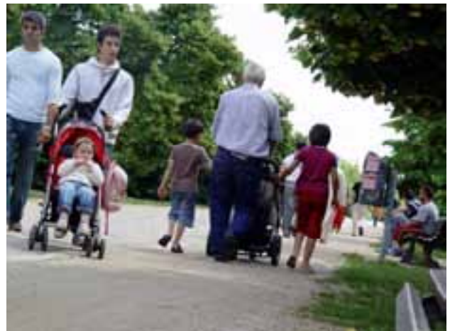
Parking - The Görlitzer Park