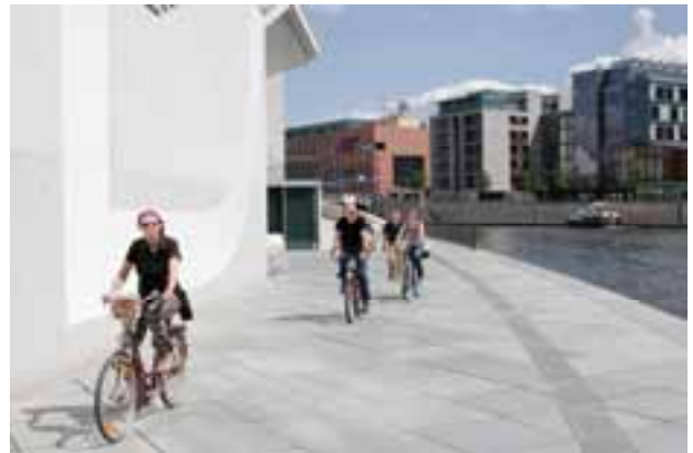
Parking - The area around the Government Quarter