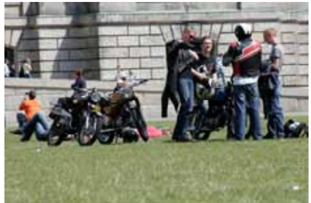
Parking - The area around the Government Quarter