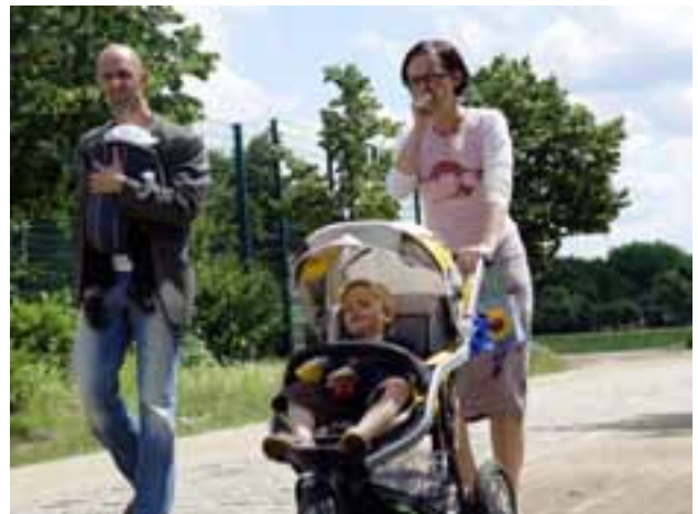
Parking - The Görlitzer Park