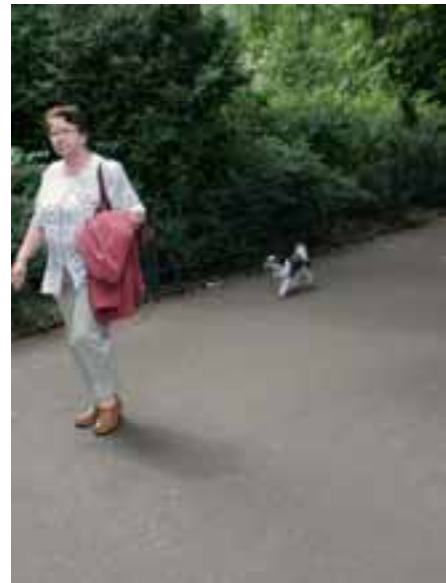
Parking - The Treptower Park