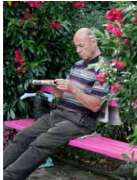
Parking - The viktoriapark