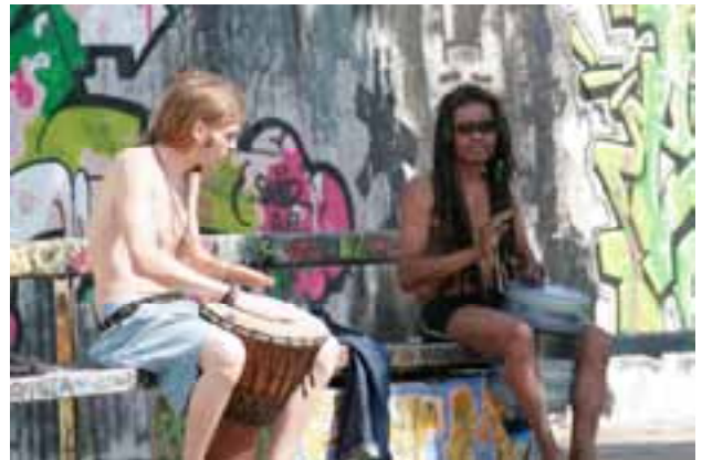
Parking - The Mauerpark