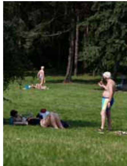
Parking - The Public Park Rehberge