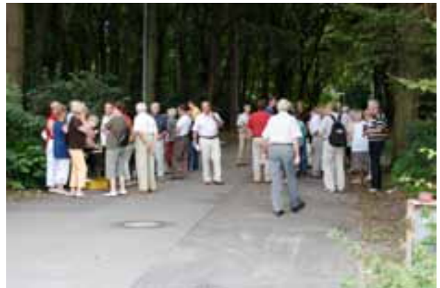
Parking - The Tiergarten