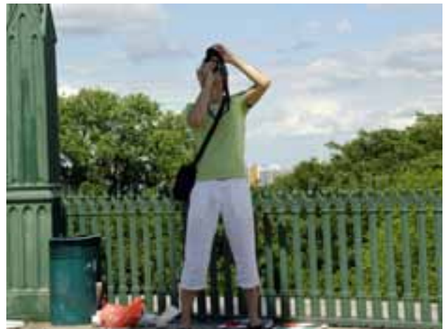
Parking - The viktoriapark