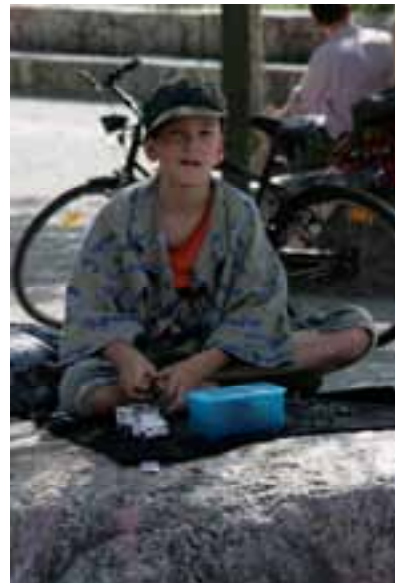
Parking - The Mauerpark