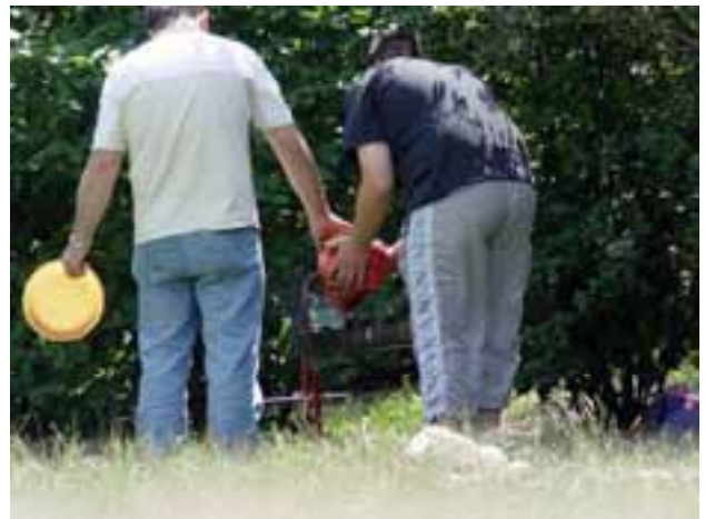
Parking - The Görlitzer Park