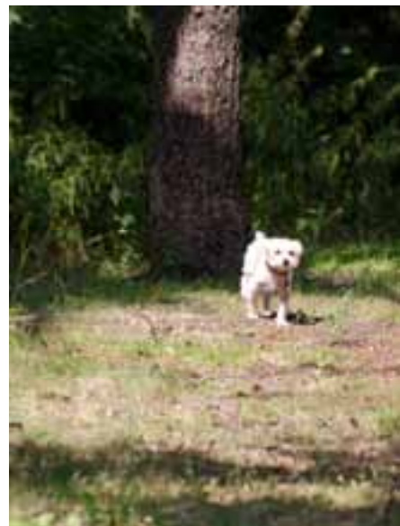
Parking - The Public Park Rehberge