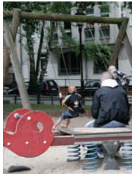
Parking - Small parks in Berlin, Spandau