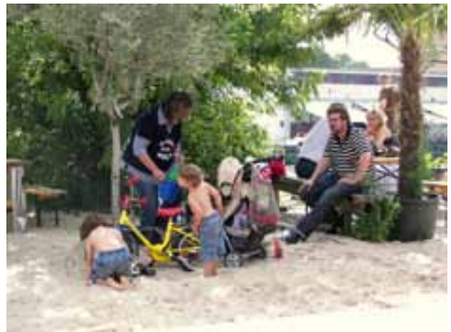
Parking - City beaches