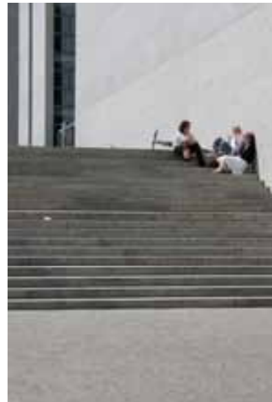
Parking - The area around the Government Quarter