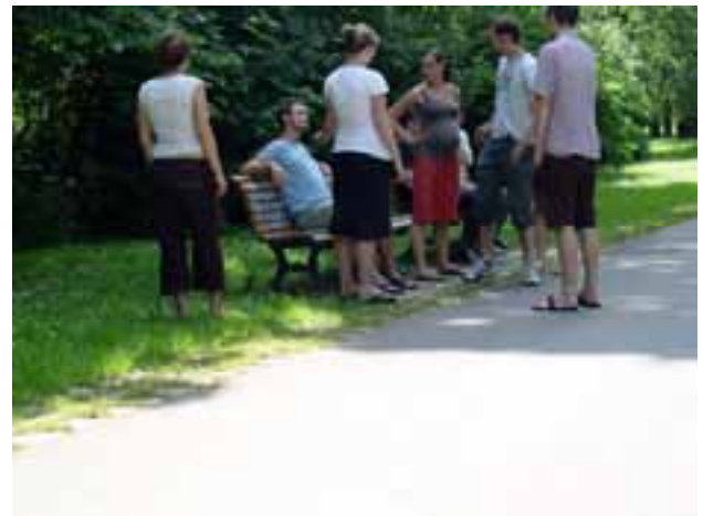
Parking - The Public Park Friedrichshain