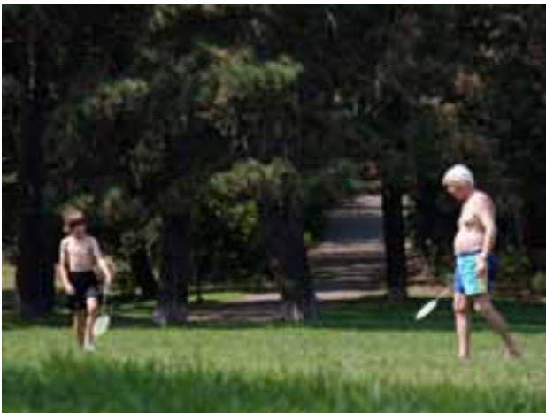
Parking - The Public Park Rehberge