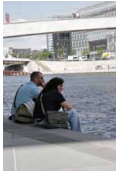
Parking - The area around the Government Quarter