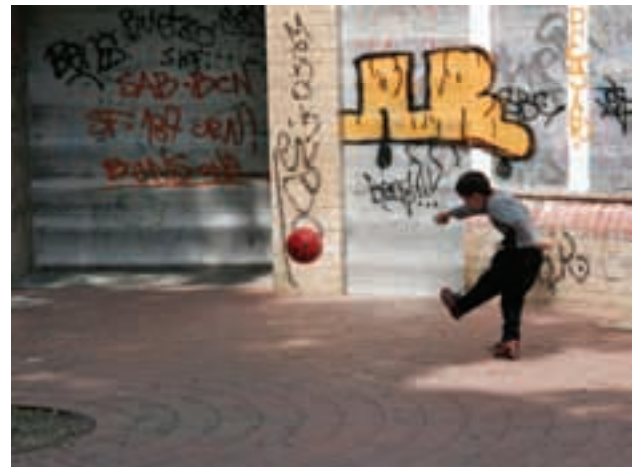
Parking - Small parks in Berlin, Spandau