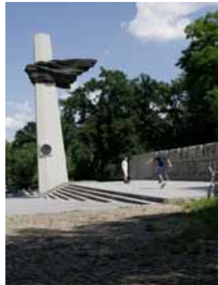
Parking - The Public Park Friedrichshain