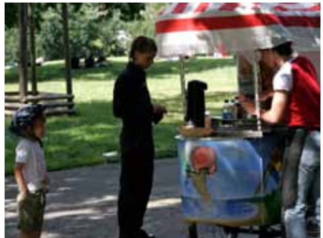
Parking - The viktoriapark